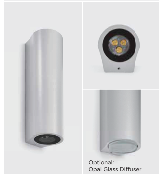
Optional: Opal Glass Diffuser